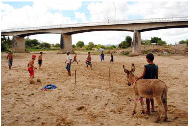
Figure 1. Pelada in Dois Riachos (Alagoas, Brazil). This is the exact context where the six-times FIFA award winning Brazilian player Marta learned to play football.

makeshift grounds, courts, etc.) where the boundaries of the playing area are often marked or created impromptu, although it may also be played in demarcated venues such as soccer fields and futsal courts (see Figure 1). In addition, pelada is played under different rules and norms to other more formal versions of football such as futsal. For example, the number of players per team depends on the number of people present to play. Age and gender are not constraining factors, and players of all ages and both sexes typically play together.